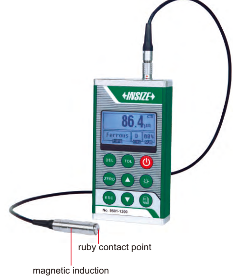
probe FE (included)

■ Magnetic induction probe (FE) measures the thickness of non-magnetic coating and non-metallic coating on magnetic metal substrate.